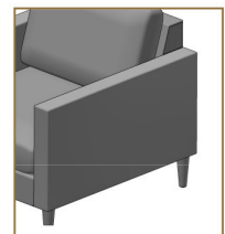
A03 ARM STYLE