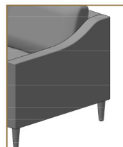
A01 ARM STYLE